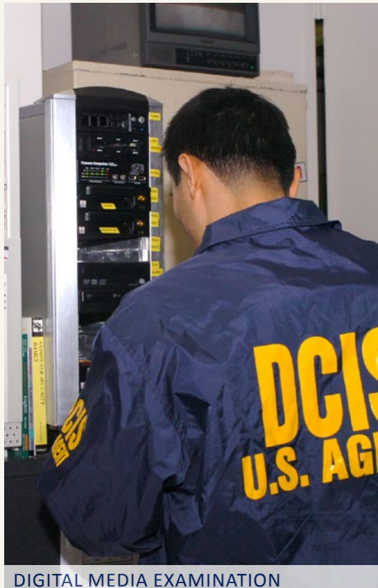
DIGITAL MEDIA EXAMINATION