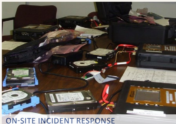
ON-SITE INCIDENT RESPONSE